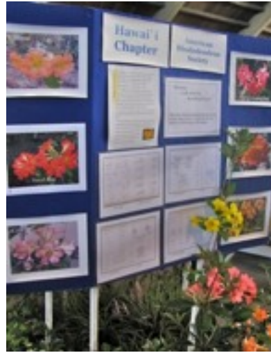
Right, a view of the poster display in the Vireya booth.