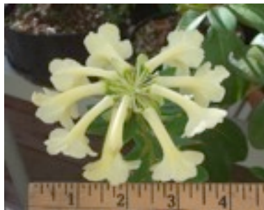
R. commonae (Cream)