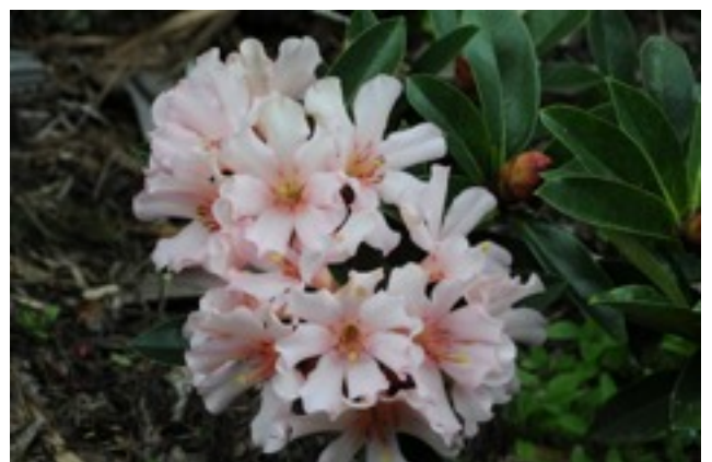
Pukeiti Rhododendron Trust and Gardens, New Zealand