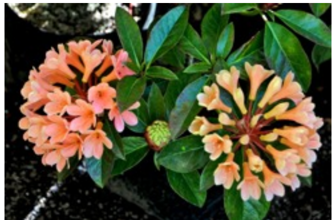
Jury's Nursery in New Zealand